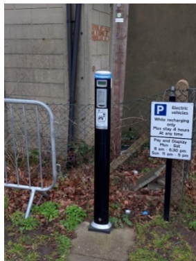
3kW charging point