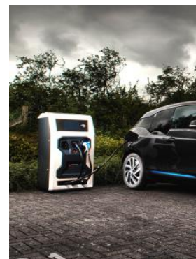
Rapid 50kW charger