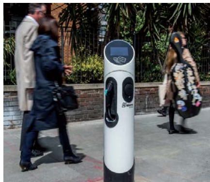
7kW charging point post